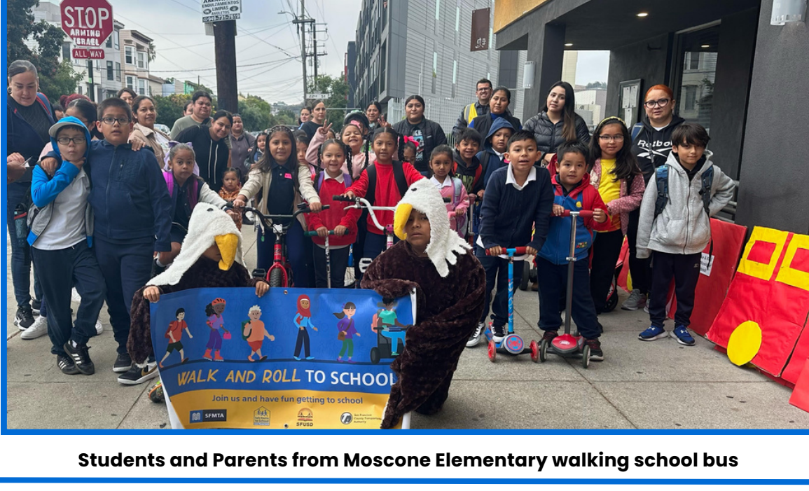
Connect with us today!

WANT TO REQUEST AN ACTIVITY AT YOUR SCHOOL OR INVITE US TO AN EVENT?