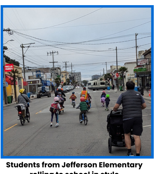
rolling to school in style