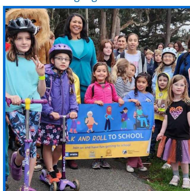
Mayor London Breed leading the Diane Feinstein Elementary walking school bus

Here are some highlights from schools all over San Francisco!