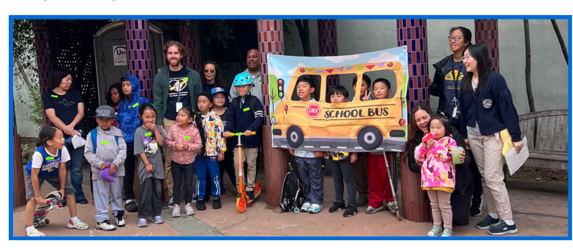
Students and Parents from Visitation Valley Elementary walking school bus