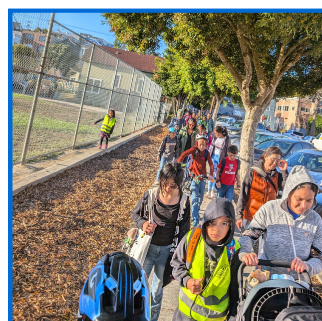
Monroe Elementary Students and Parents enjoyed their walking school bus