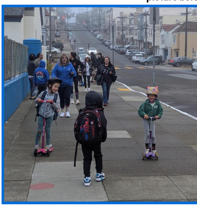
Students and Parents from Lafayette Elementary walking and rolling to School